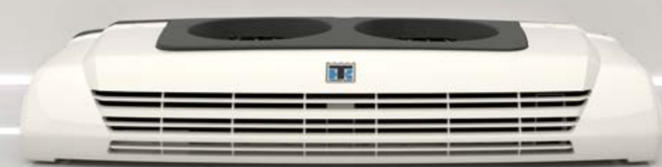
C-450 TO C-750

If you want a highly efficient and sustainable unit for both frozen and fresh applications, the new bigger and better C-Series range is the ideal solution for you.