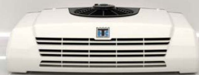
C-150 TO C-350